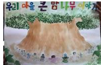
↓ A taste of the show

It has taken almost three years and it is almost finished. It will include Taiko and handmade drawings. It is currently available on YouTube. ( http://www.youtube.com/watch?v=6153UAq9yKg )