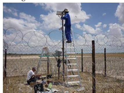
▼ Setting up weather equipment. Now, to plant the rice...

I have spent my time positively, thinking this an opportunity to train myself, to a lifestyle I am finally becoming used to.